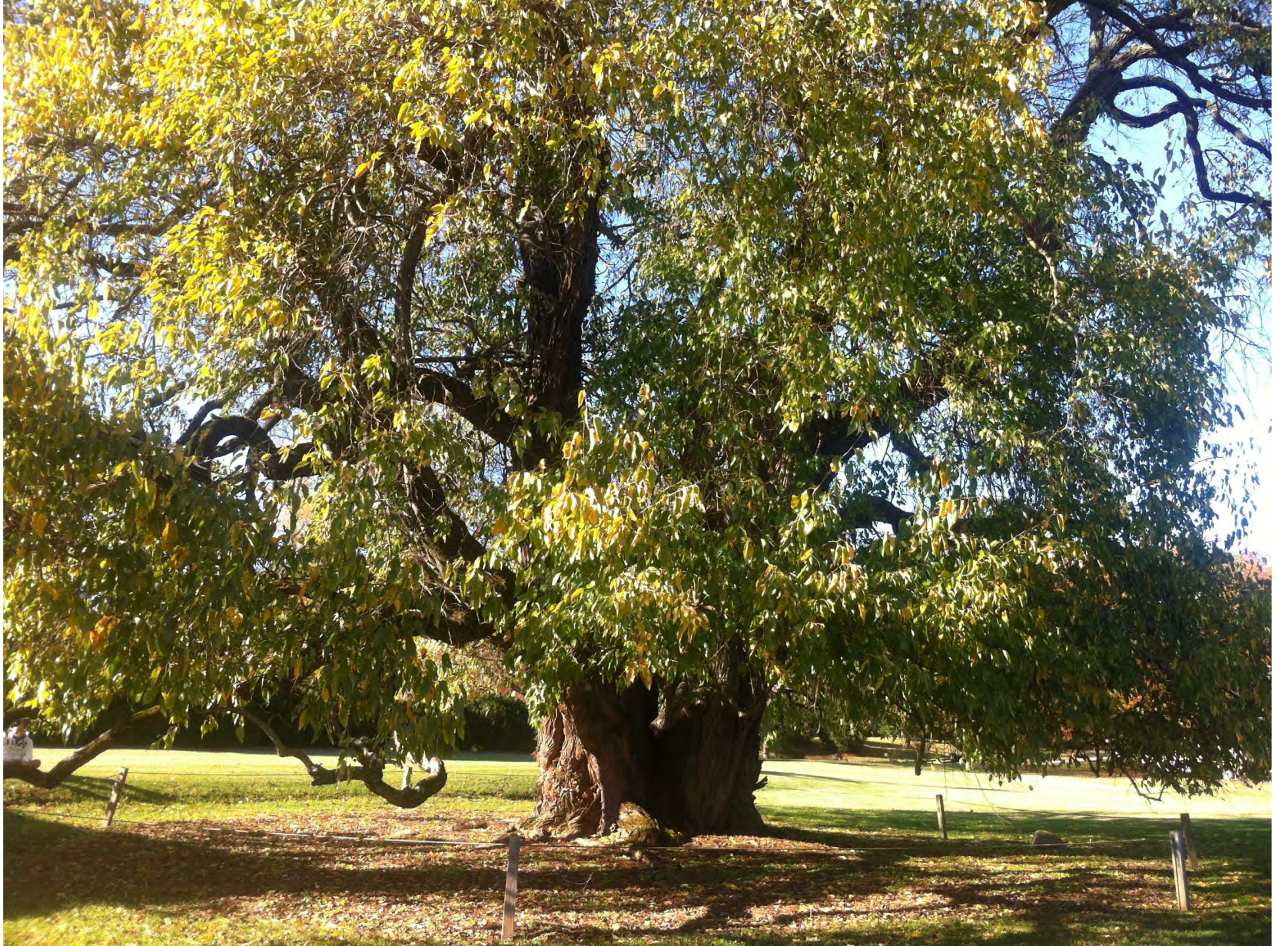
Osage Orange Tree