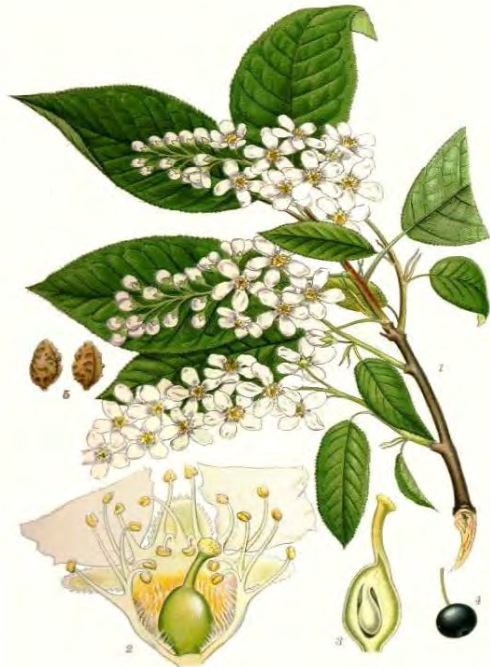
HÄGG, PRUNUS PADUS L.