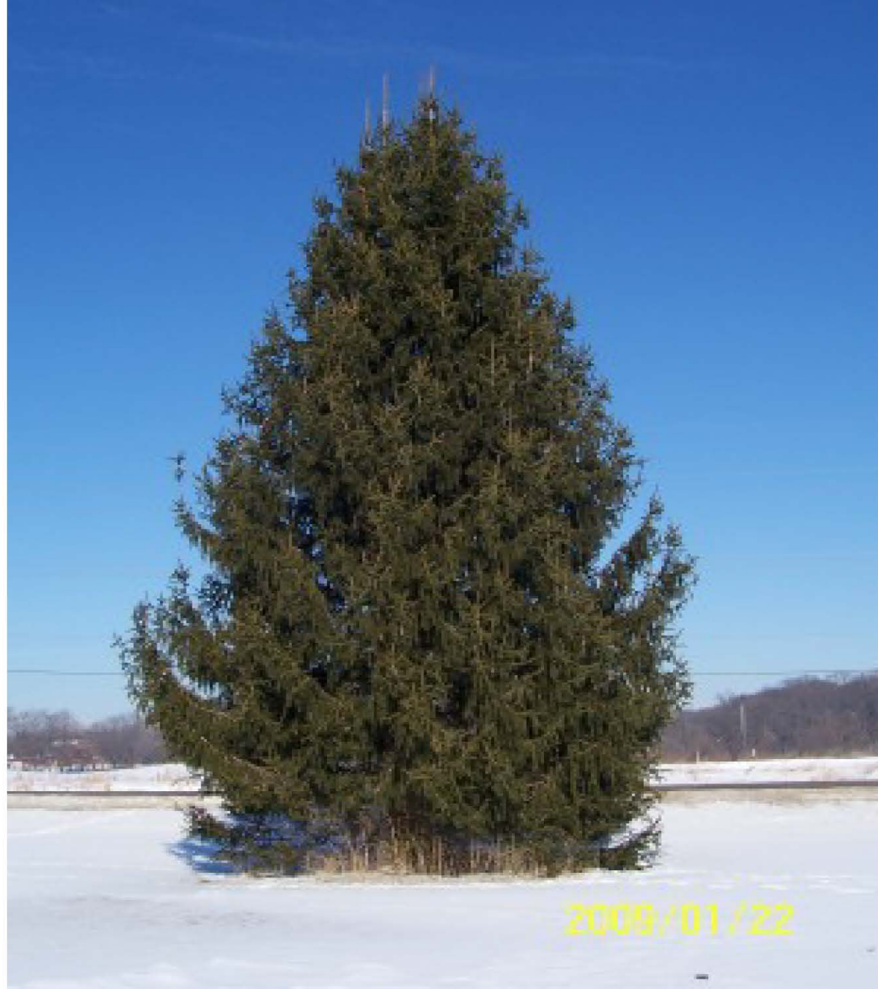
Norway Spruce Tree